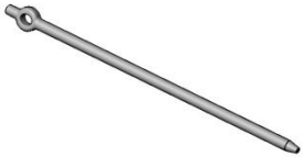
Steel Pin, 20" 859-3216

The part number below the item name refers to the NATO Stock Number (NSN) when prefixed by "8340-21-".