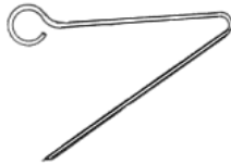
Anchor, Hook, 12" 859-3217